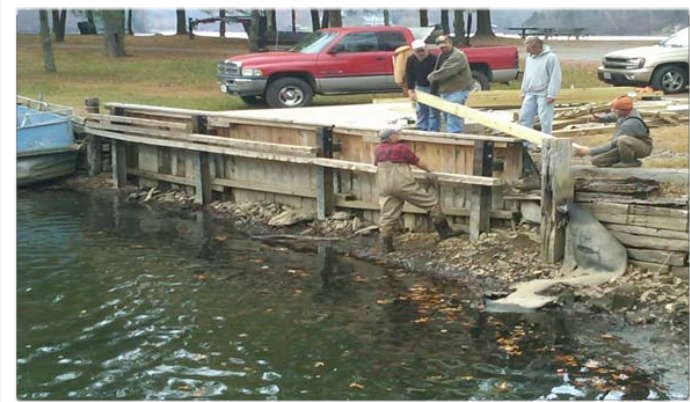
Abutment at Harry DeHaven being repaired for 2013

control. FOCL is actively seeking additional sites including possible sites above Lowman's Ferry Bridge. Identifying possible sites above Lowman's Ferry Bridge for an abutment and debris storage would provide FOCL the opportunity to begin more extensive service of clean up above