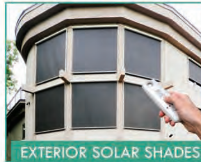
EXTERIOR SOLAR SHADES

Betterliving SUNROOMS & AWNINGS by XTERIOR PLUS, INC.