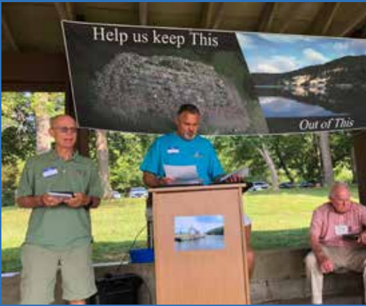
Visit www.focl.org for the complete meeting minutes